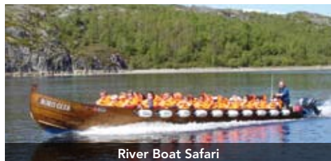
River Boat Safari

The only town in Norway where East meets West, Kirkenes represents the turning point of your Hurtigruten voyage. We start with a short tour of the town, before the bus takes us deep into the surprisingly fertile landscape. We make a stop at Storskog - the border station between Norway and Russia. All year round $57