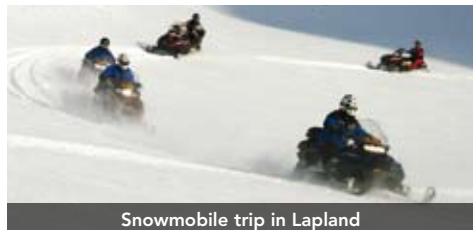
Snowmobile trip in Lapland

A unique opportunity to meet a family of Sami reindeer herders and visit the Foldal Coastal center, this fascinating excursion offers an insight into the rich history of the Finnmark area. 5.5 – 9.5 $111