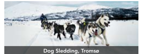
Dog Sledding, Tromsø

wall is a fabulous stained glass window and visits Polaria, an interpretive center about the Arctic. All year round $68