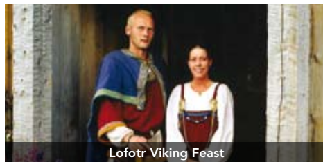
Lofotr Viking Feast

At the Lofotr Viking Museum, the largest Viking building ever found has been recreated. The Chieftain and the Lady of the house invite you to join in a real Viking feast. Experience the magic and excitement as they make sacrifices to the Gods, hoping that the sun will turn to avoid Armageddon. 1.1 – 3.28 / 9.28 – 12.31 $135